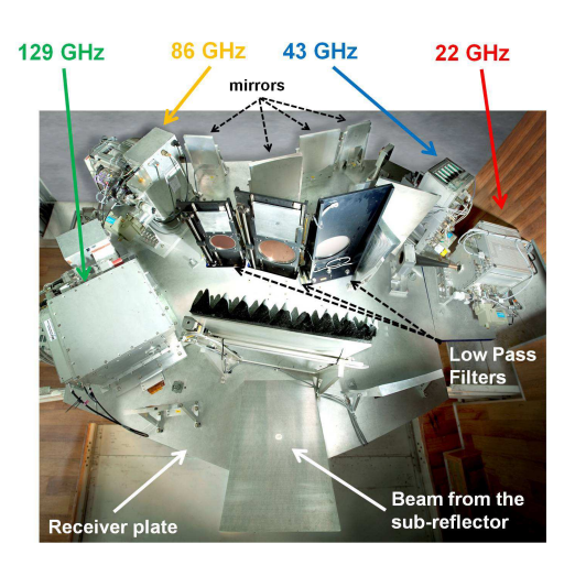
Fig. 1. KVN 4 channel receiving system (Han et al. 2008)

ture of active galactic nuclei (AGNs) at the mil-